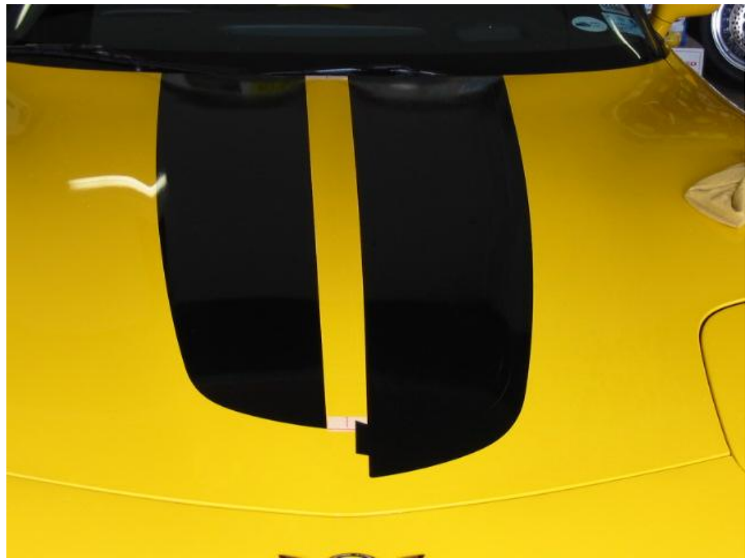
Do the same thing for the other side and remove both of the spacers and you have this final look